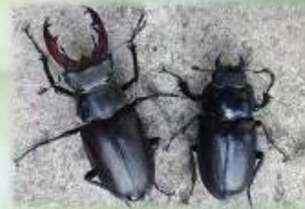
Male and female Stag Beetles