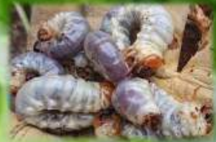
Stag Beetle larvae

Did you know.... The jaws of the male stag beetle look fearsome, but are actually quite weak, making this beetle pretty harmless to humans.