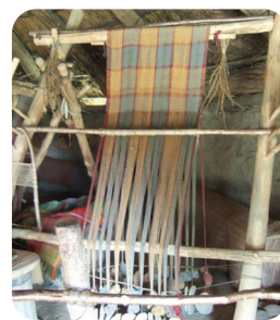
Colourful cloth weaving