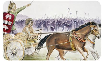
Artist's impression of Celtic warriors