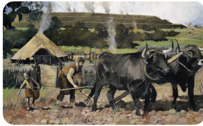
Artist's impression of Iron Age arable farming