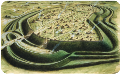
Artist's impression of an Iron Age hillfort